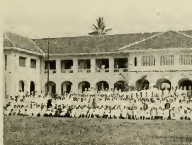
Anglo-Chinese Girls' School, Penang

“That we reiterate our belief in the importance of adequate support, both on the field and at home, for a strong central organization of such character as seems advisable in the light of the needs in the Philippines at the close of the war.